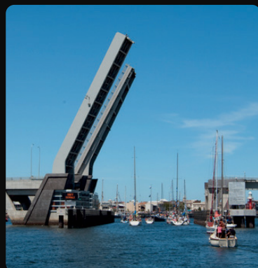
MARINE AND PORTS