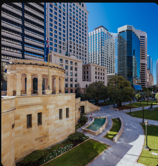
PUBLIC REALM & URBAN REGENERATION