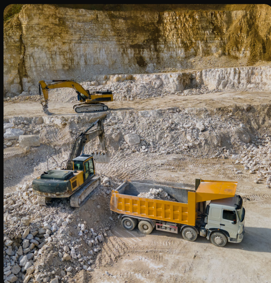
MINING AND RESOURCES